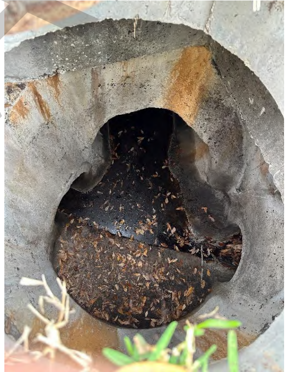
Opened manhole on S Rome Ave to confirm drainage into Swann Pond