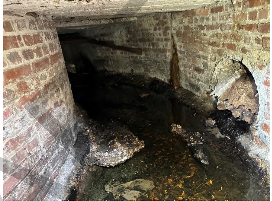
42"x48" Box Culvert bend at the intersection of W De Leon St and S Oregon Ave.