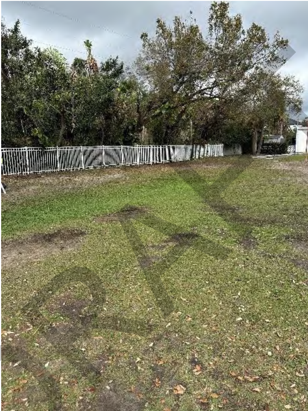
Storm pipe in inventory is not found in field behind BridgePrep at St. John's School