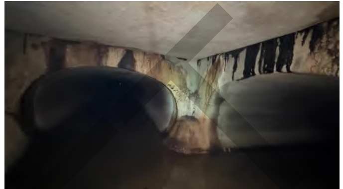
Manhole at the intersection of W Parkland Blvd and S Forest Dr confirms the 90-degree turn of the 48"x76" ERCP