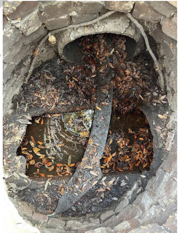
Manhole near the southwest corner of St. John the Baptist Greek Orthodox Church building that connects the 18" RCP from Moody Ave S to the 24" RCP that conveys water north to W Swann Ave