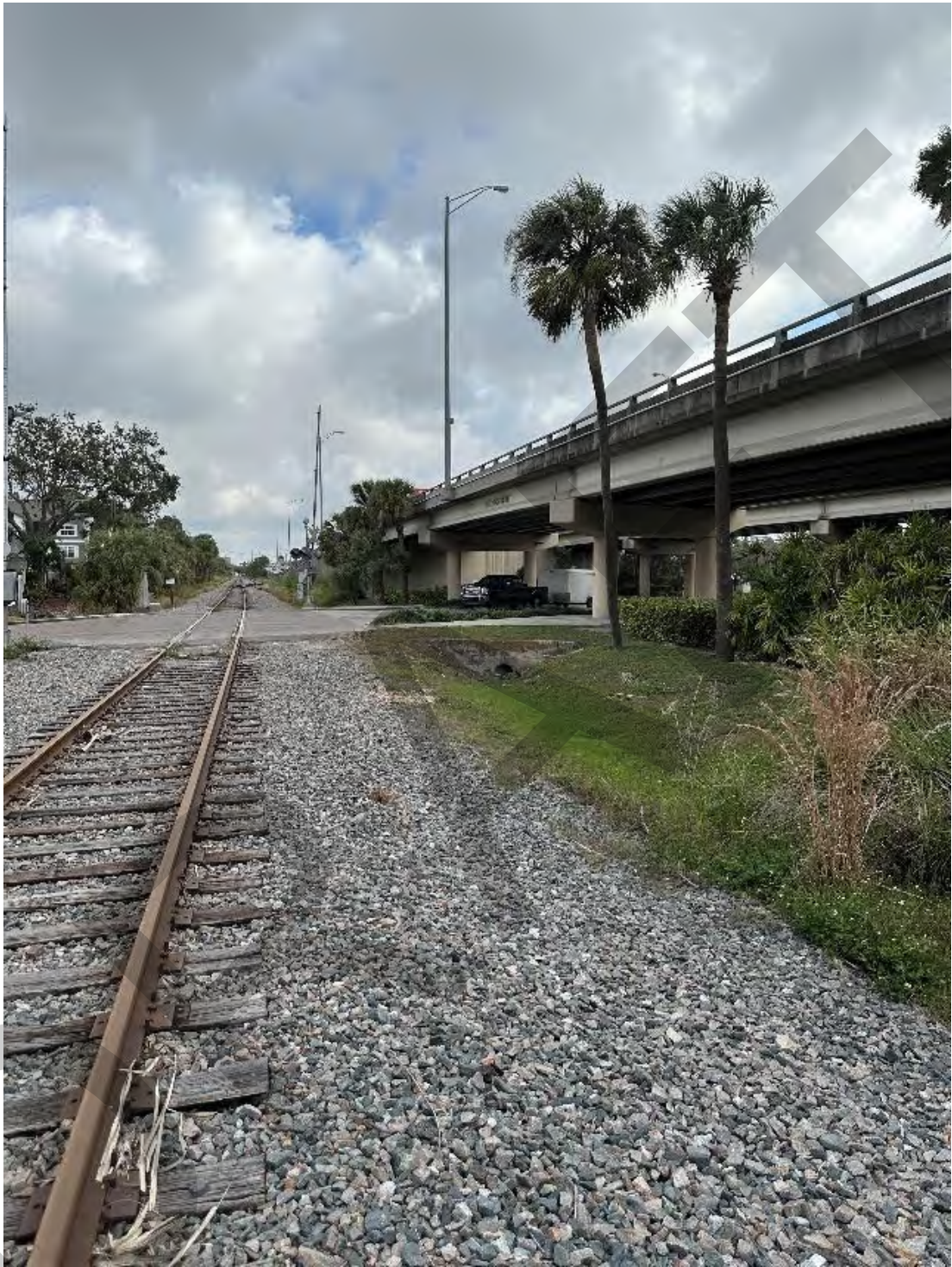
CSX Railroad, looking north toward W Swann Ave