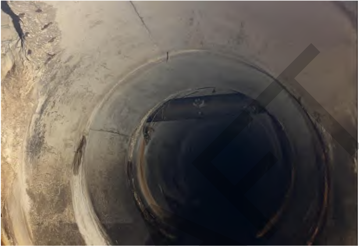
Verified change in size from 48" RCP to 60" RCP at the intersection of W Estrella St and S Habana Ave