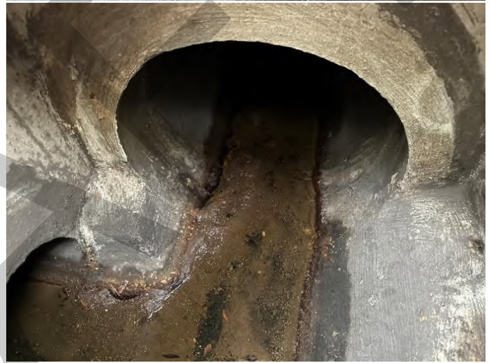
Manhole at the intersection of W Parkland Blvd and S Lakeview Rd. Confirmed a 36" RCP along W Parkland Blvd and a 19"x30" ERCP connecting from S Lakeview Rd