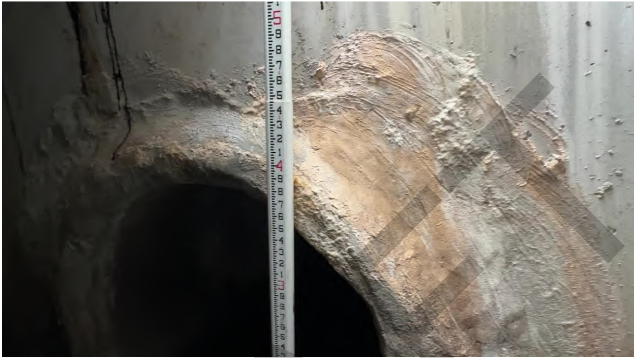
Intersection of W Morrison Ave and S Marti St where the 48"x76" ERCP constricts to a 48" RCP