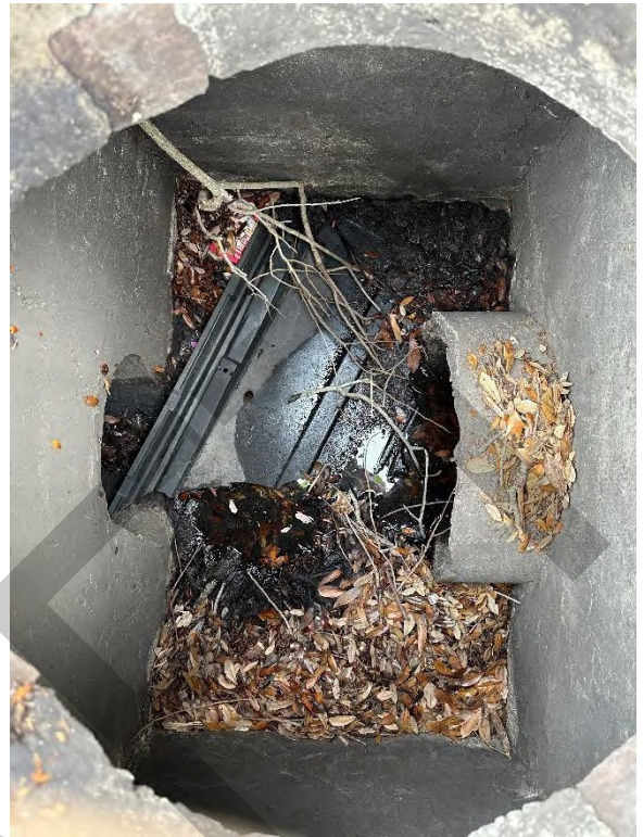
Confirmed inlet on S Moody Ave has an 18" RCP that runs to the west through the school parking lot for St. John the Baptist Greek Orthodox Church