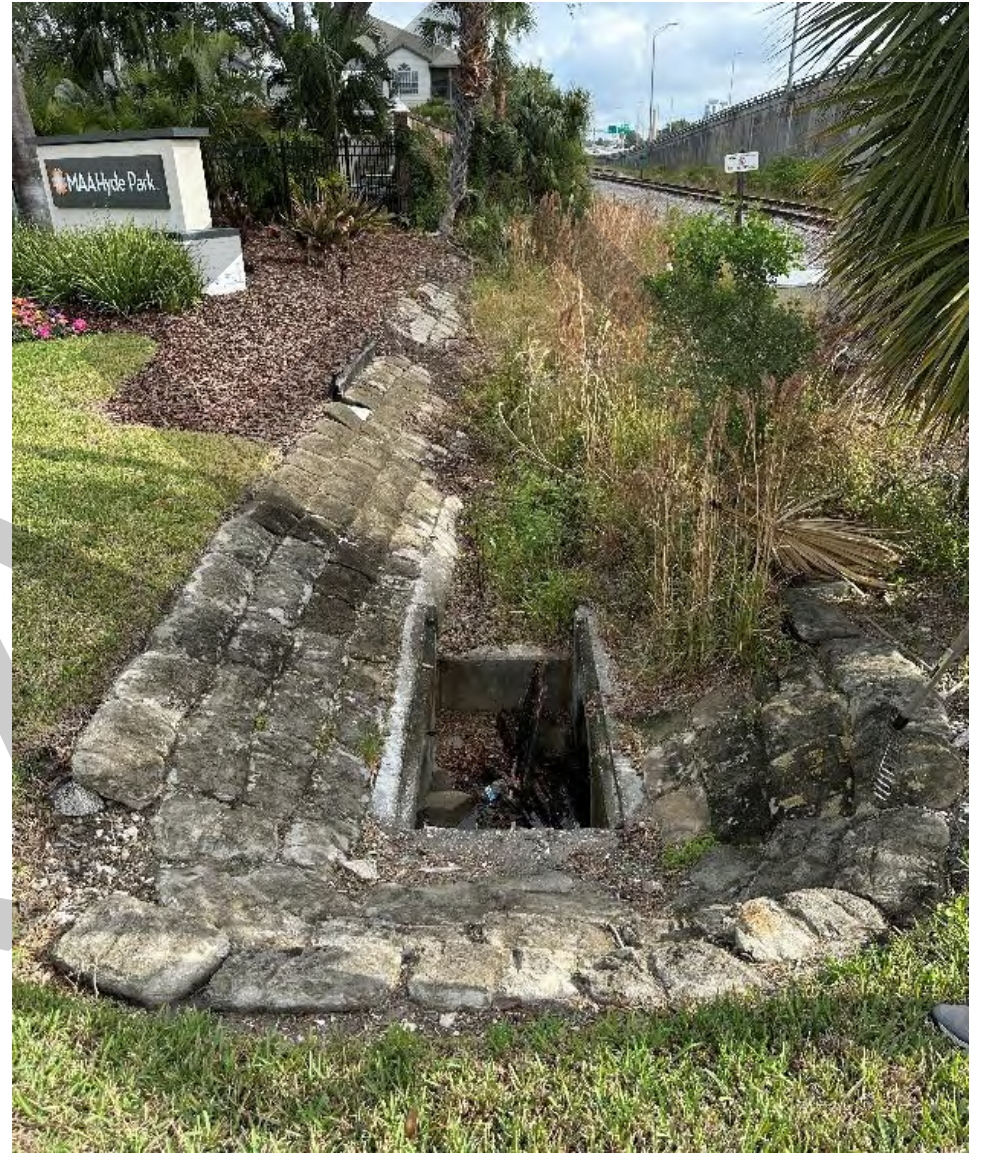
Open-topped structure near W Swann Ave's crossing with the Selmon Expressway