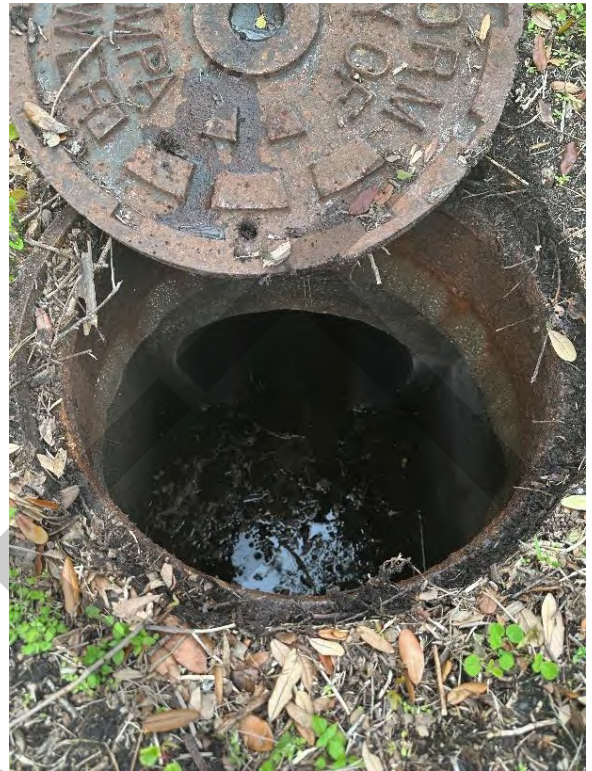
Opened manhole confirms that pipe from W Palm Drive bypasses the stormwater pond adjacent to The Atrium on Bayshore