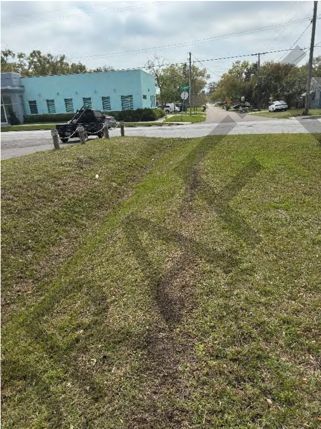
Ditch that carries stormwater south to W Cypress St at S Gomez Ave