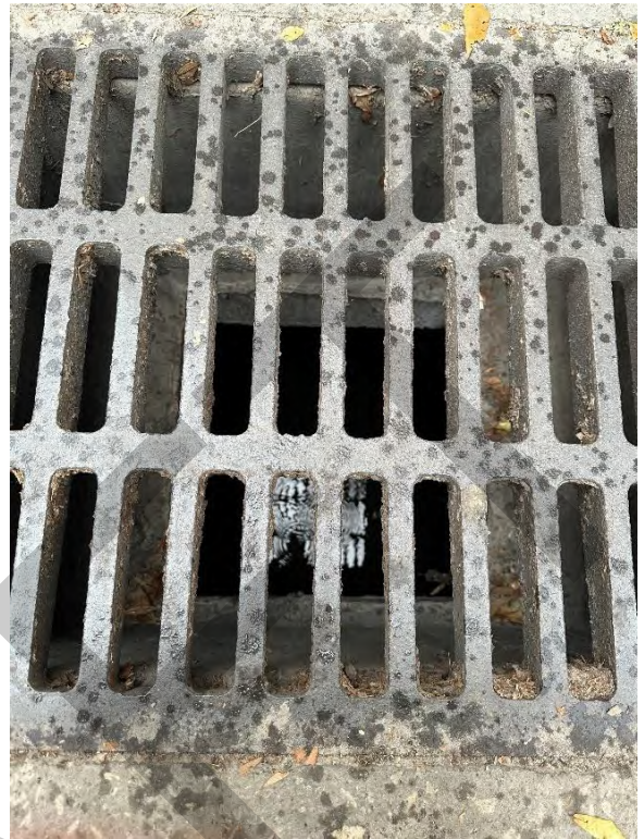
Grate with the 4'x8' box culvert connecting to AMI pond