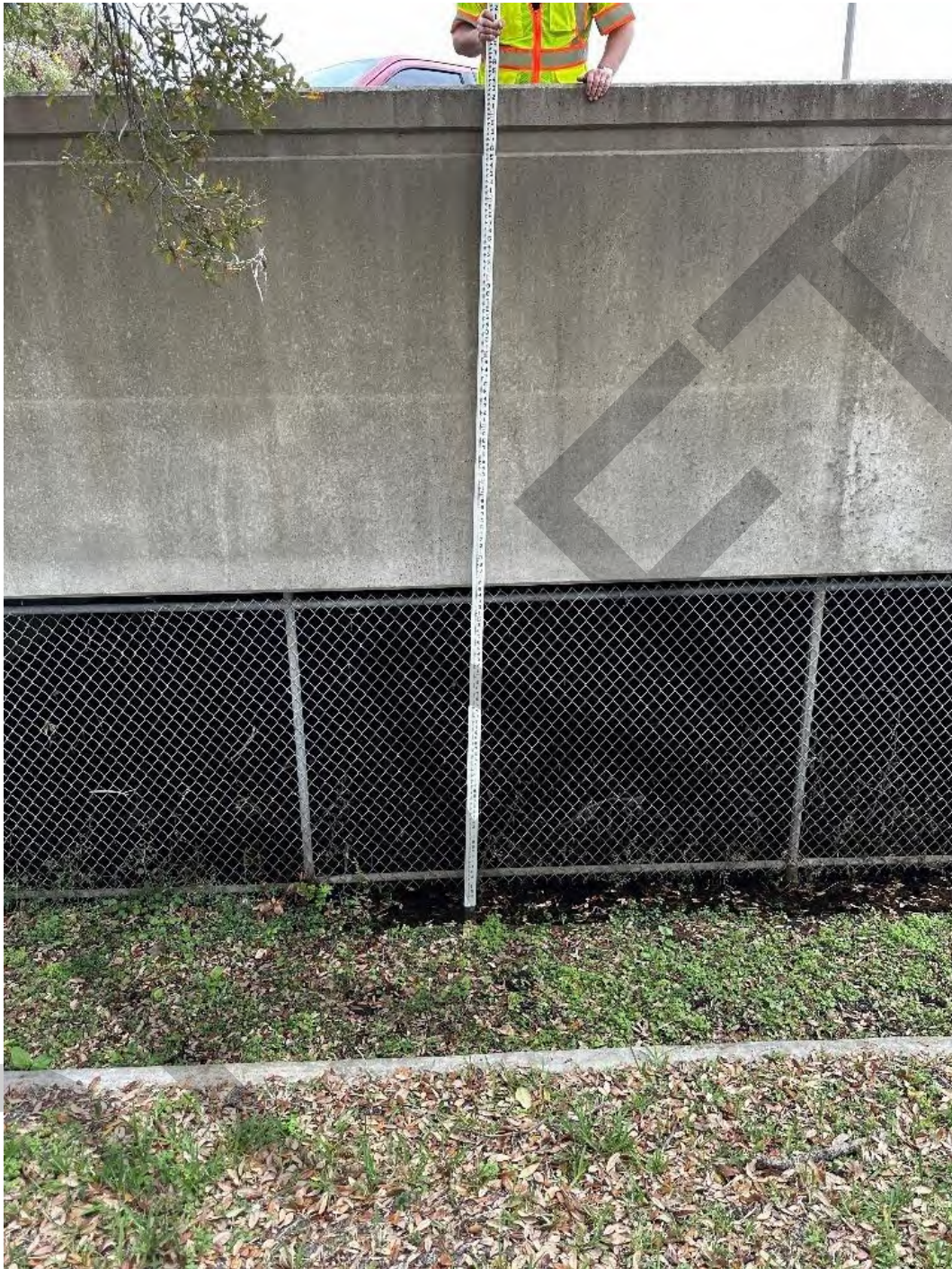
East side of AMI pond. Measured to verify information in reference plans. Standing water observed.