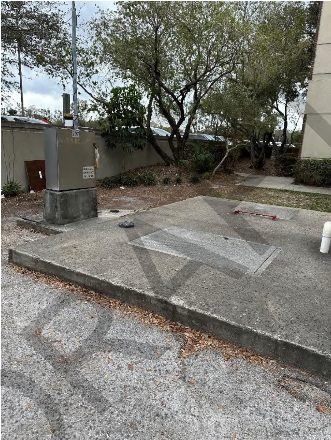
Pump station at AMI pond