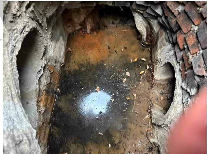
Manhole at the intersection of W De Leon St and S Tampania Ave. Confirmed 18" pipe to the west along W De Leon with a 15" pipe coming in from the north