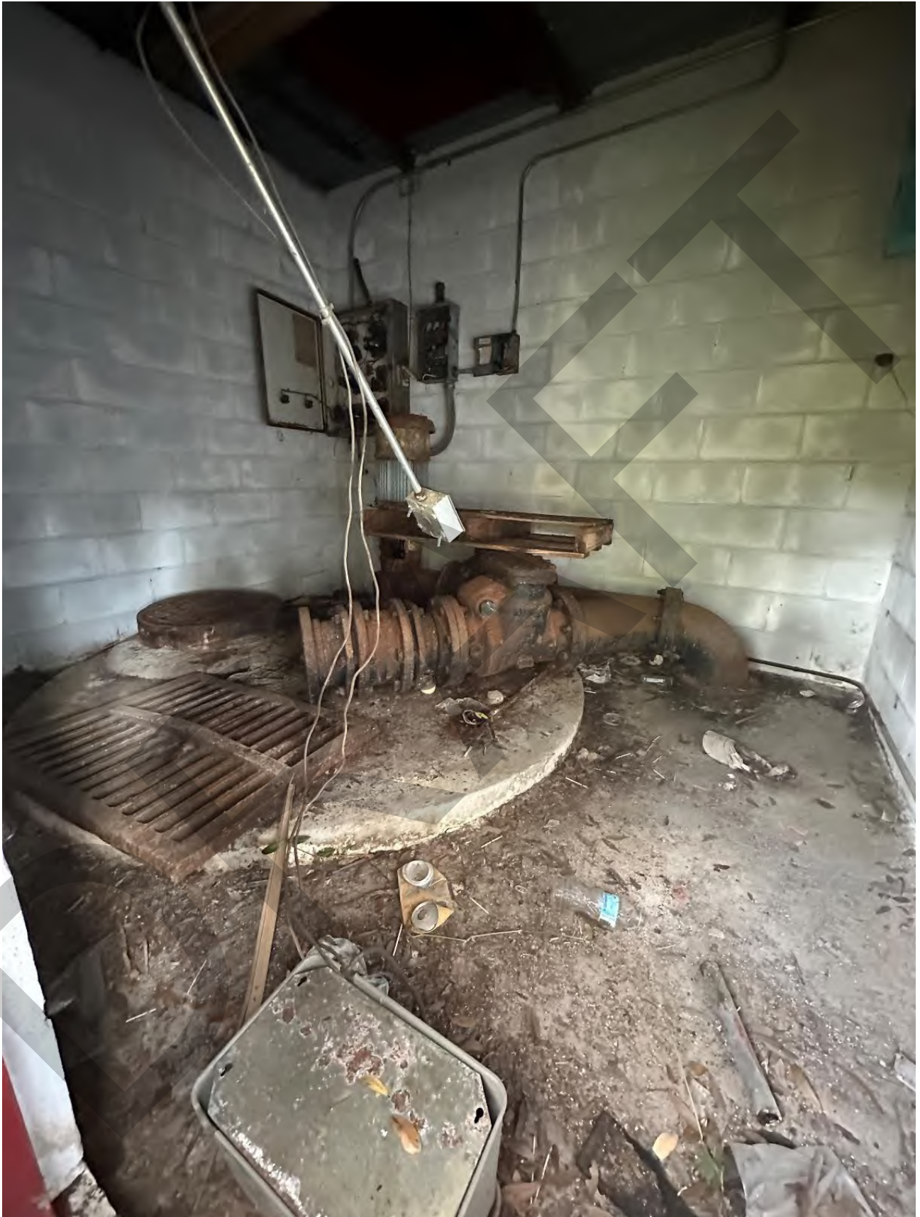
Albany Pond Pump Station (not operational)