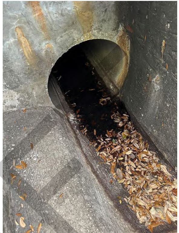
Verified drainage connectivity at W Swann Ave and S Armenia Ave