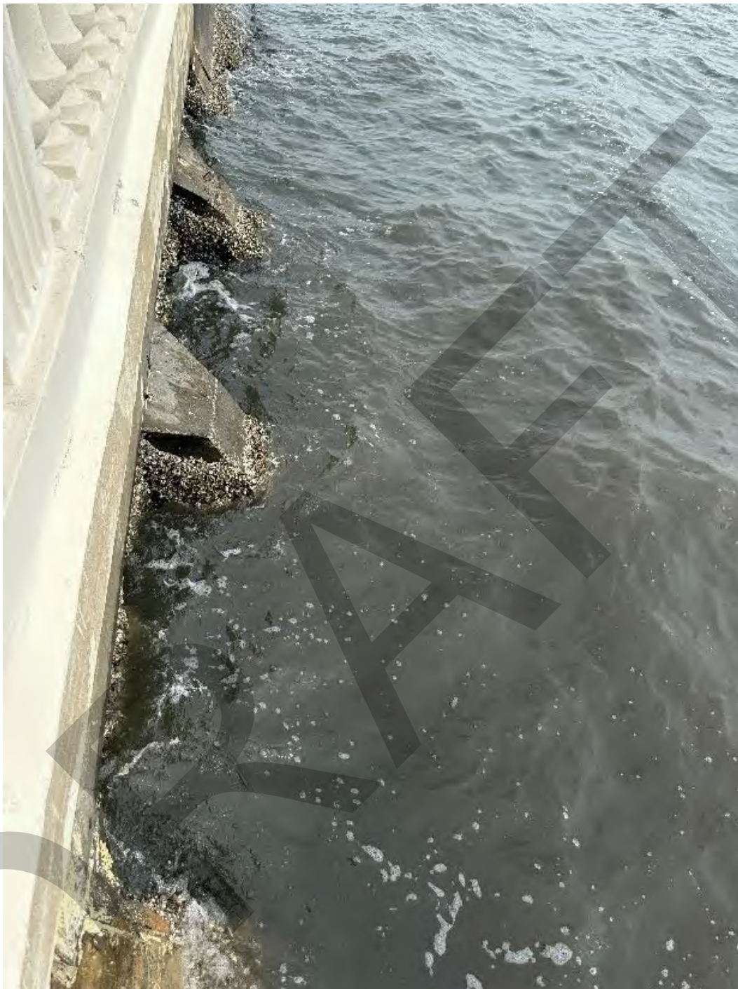
Triple 4'x6' box culvert outfall into Hillsborough Bay at Bayshore Blvd and S Howard Ave